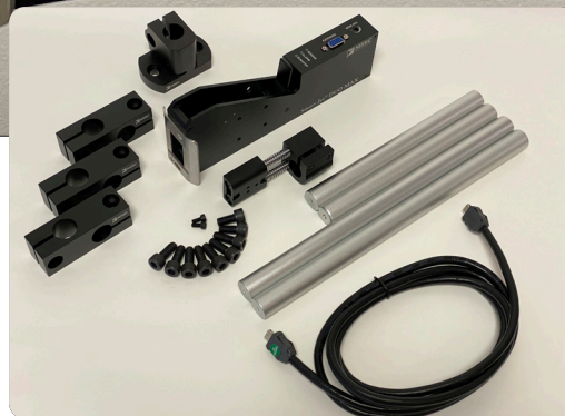
Pieces included in each printhead box