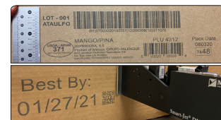
Porous and non-porous print