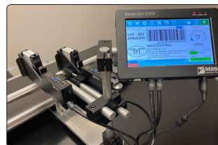
Connect up to 2 printheads at one time