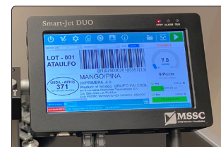
Message on 7" Touchscreen