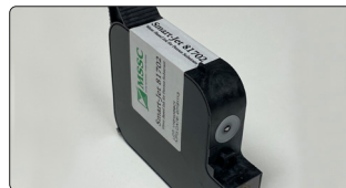
TIJ 1" cartridge technology